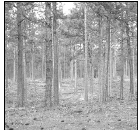
Ridge Road area on the main Foundation following mechanical thinning in early January

the smaller tress. A basal area of approximately 60 (which is an optimal density for a stable ecosystem of long leaf pine) was achieved during this effort. This area will rest until 2006 when a cool season burn will be used to continue the restoration process.