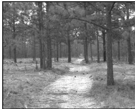
Firestone meadow in North Country after some mechanical thinning and re-grooming of the existing trail system.

These thickets were mechanically thinned using a rubber-tired Bobcat this fall. Special care was taken to protect the wiregrass and we should see healthy new growth in the summer of 2005. After the work was accomplished the adjacent trails were re-groomed. The meadow will be maintained in an open state through the use of prescribed fire in coming years. It will become a haven for wildlife and its open quality will enrich the visual landscape. Change is always challenging but this area should progress quickly into a beautiful meadow of wire grass and an open cover of long leaf pine. In another