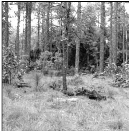
Do you know this spot?

When notification of an injured person on the Foundation is received by 911, the caller needs to provide the number/letter of the nearest marker. At that point the