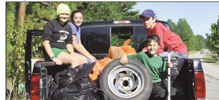
TRASH DETAIL: MEMBERS OF THE MOORE COUNTY PONY CLUB CLEANED UP GARBAGE ALONG MAY STREET AND FURR ROAD.

An additional thank you to those who of you who clear trails in your own backyards and continually volunteer your time and energy to clear trails on the Foundation. You know who you are and we salute you too!